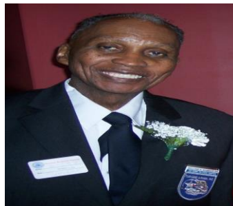
William A. Samber, Sr. “Original Tuskegee Airman” Aviation/ Math and Science Scholarship