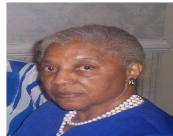
Hon. Ernestine Washington Library Science/ English Language Arts Scholarship