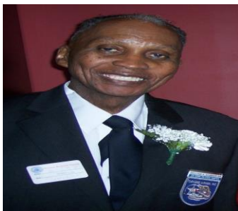
William A. Samber, Sr. “Original Tuskegee Airman” Aviation/ Math and Science Scholarship