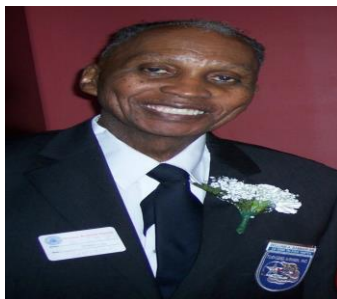
William A. Samber, Sr. “Original Tuskegee Airman” Aviation/ Math and Science Scholarship